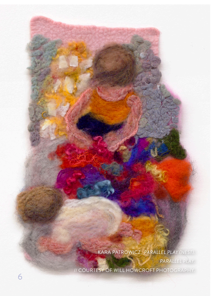
KARA PATROWICZ, PARALLEL PLAY (NEST) . PARALLEL PLAY .