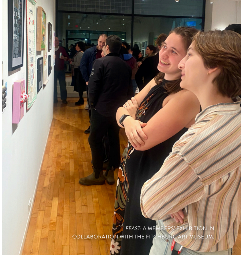
FEAST: A MEMBERS' EXHIBITION IN COLLABORATION WITH THE FITCHBURG ART MUSEUM.