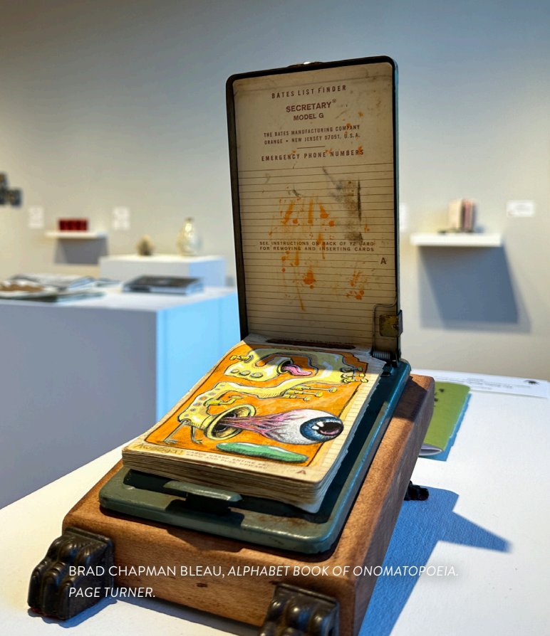
BRAD CHAPMAN BLEAU, ALPHABET BOOK OF ONOMATOPOEIA. PAGE TURNER.